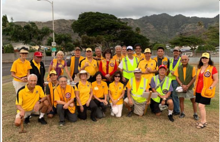
Group photo of Lions before setting up for the Hawaii Kai parade.