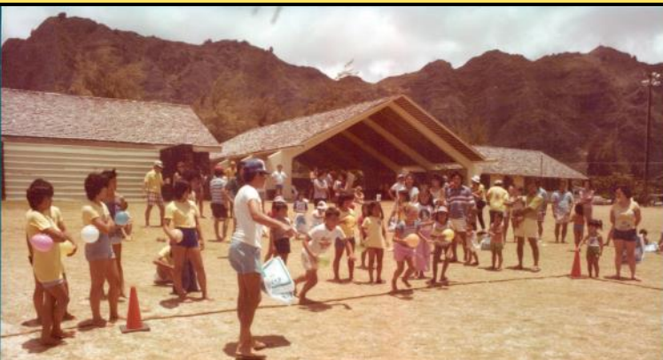
HK Lions Club Picnic from the 1970's.