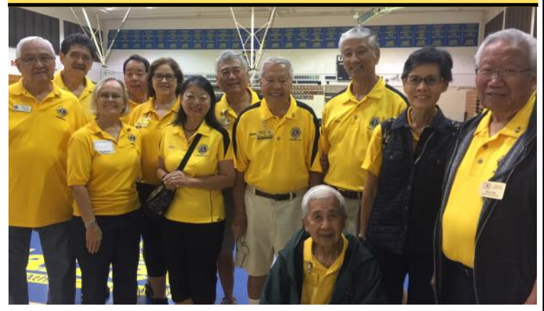
Group photo of HK Lions at Kaiser Complex Field Day.