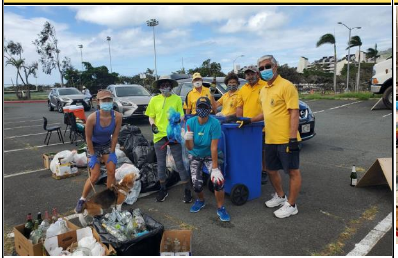
HK Lions got together for a group photo during the recycling drive.