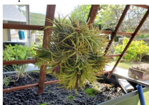
A tillandsia creation from Ellsworth's yard.