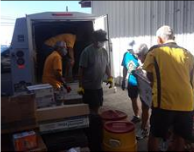
HK Lions moving pancake breakfast equipment to Prez. Eric’s van.