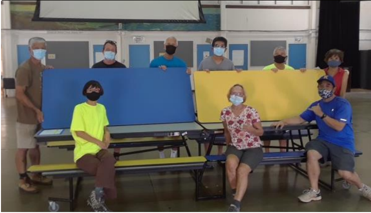
Group photo of the HK Lions with the finished cafeteria tables.