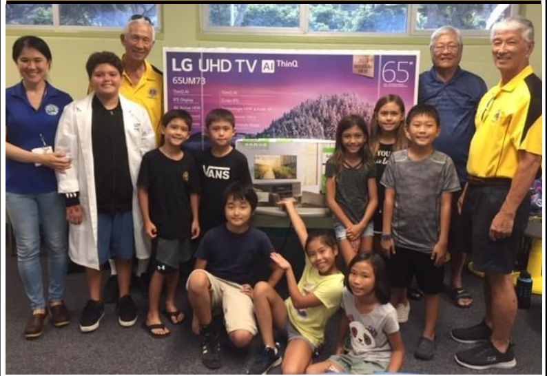
Group photo of HK Lions with students of Hahaione Elem. School.