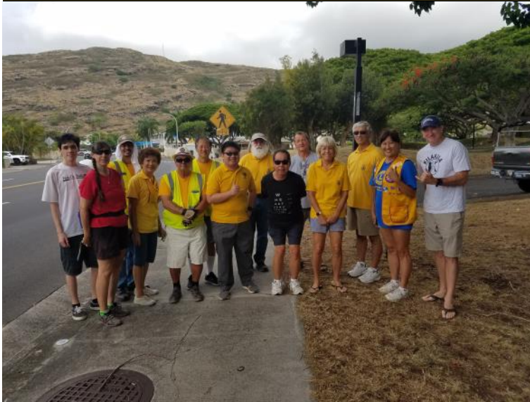
Group photo of HK Lions at the storm drain labeling project.