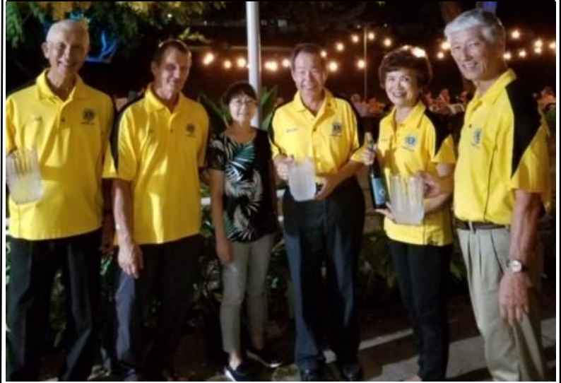
Group photo of HK Lions at Lunalilo Home’s Moonlight Dinner.