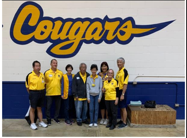
HK Lions at Kaiser Complex Fitness Day on Feb. 7th 2020