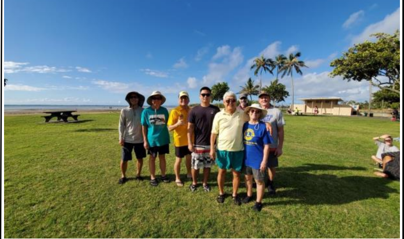
Group photo of HK Lions at Malama Maunalua Community huki.