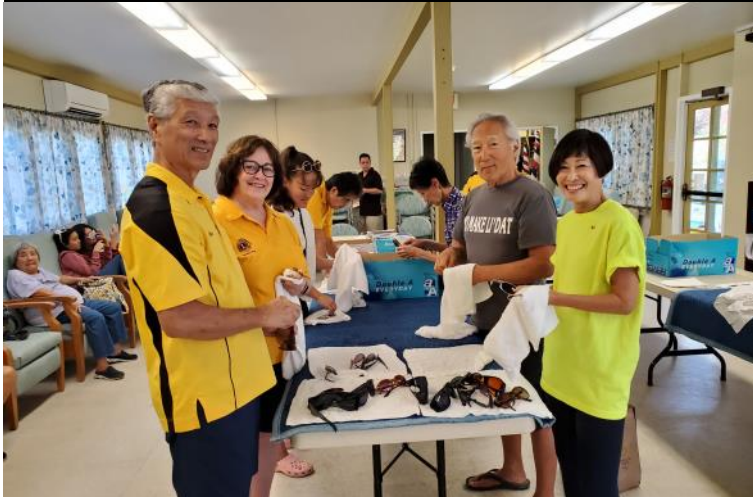
Group photo of lions cleaning eyeglasses with Kaiser HS Leos.