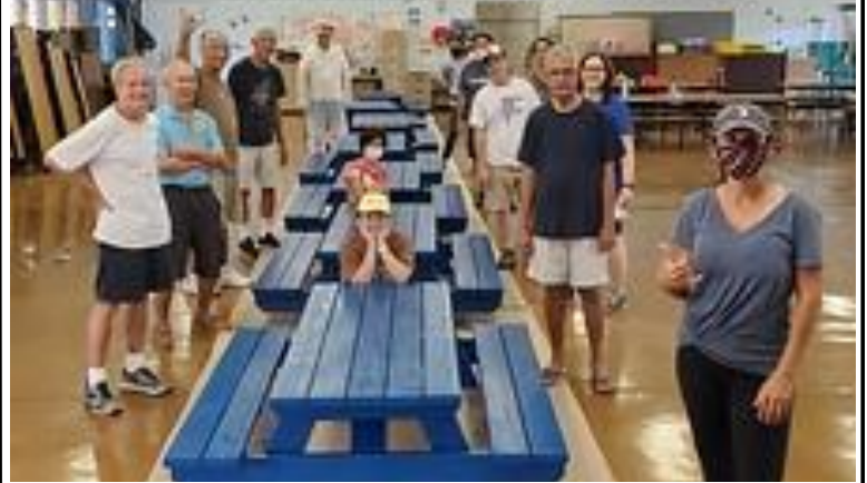
Group photo of HK Lions after completing the picnic tables.