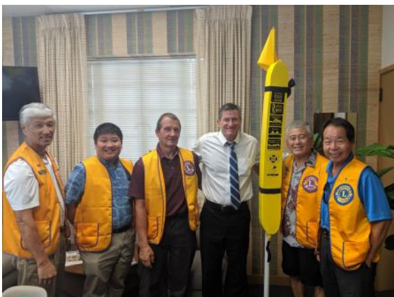
Group photo with Councilmember Waters in July 2019.

There has been significant progress in the past two months to complete an agreement to formalize the Lion Club’s installation and maintenance of rescue tubes on beach parks and other property managed by the City and County of Honolulu. This agreement will result in another 15 tubes installed across the East Honolulu and Windward coast to be managed by several Lions Club. Hopefully this agreement will pave the way for large scale installation of rescue tubes across O’ahu.