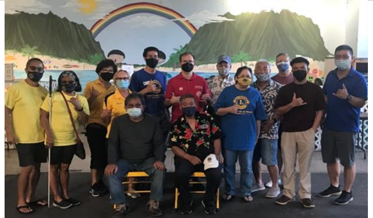
HK Lions joined five other clubs at the most recent dinner project.