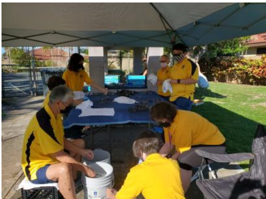
HK Lions cleaning glasses in assembly line fashion.

Thank you to the Lions who collected and stored eyeglasses from the various stores and optometrists throughout the year.