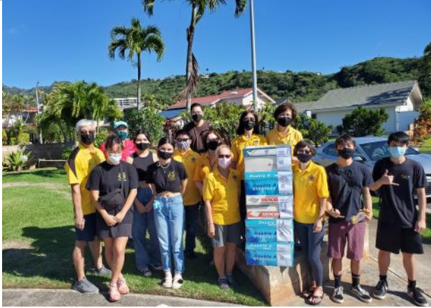
HK Lions with Kaiser HS Leos after cleaning hundreds of glasses.