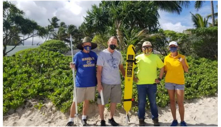
The Rescue Tube Committee installed two-rescue tubes in Kailua.