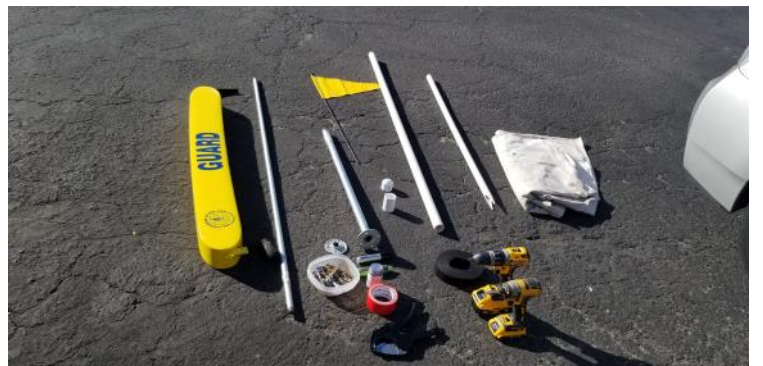
A breakdown of all the parts to install a rescue tube placement.