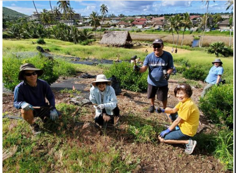
HK Lions hard at work pulling weeds at Keawawa Wetland.