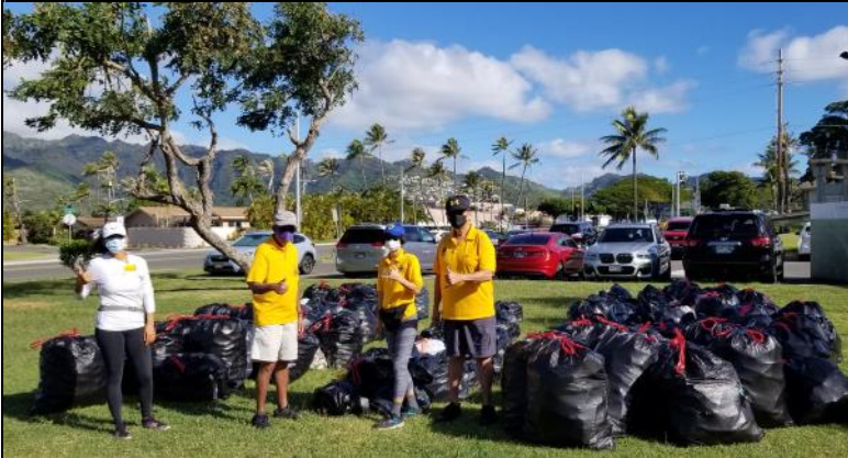
HK Lions sorted through hundreds of recycled cans and bottles.