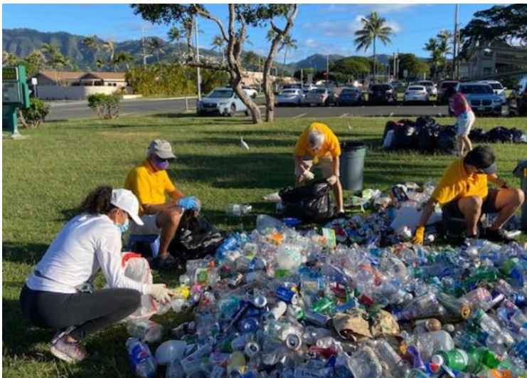
HK Lions starting the sorting process early in the morning.