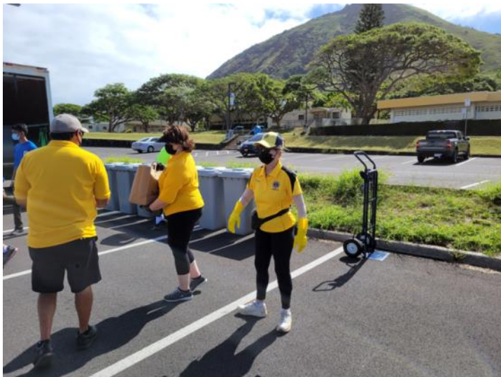
HK Lions formed assembly line to handle recycling items.