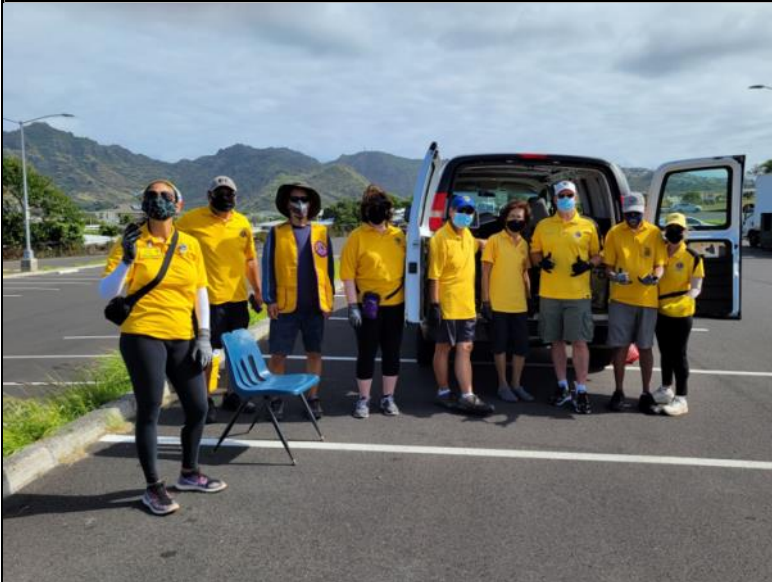
Group photo of HK Lions at recycling event.