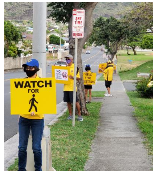
HK Lions sign-waving during morning commute.

In support of the Community Policing Team of District 7 East Honolulu and Kamiloiki Elementary School, the Hawaii Kai Lions continue to encourage safe driving near our schools and look forward to future beneficial projects with them and other schools within the community.