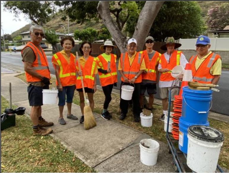
HK Lions lined up along Pepeekeo Street.