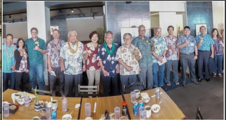
HK Lions lined up for a group photo.