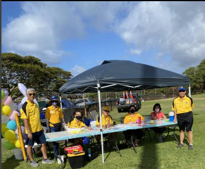
Group photo of HK Lions at Easter registration booth.