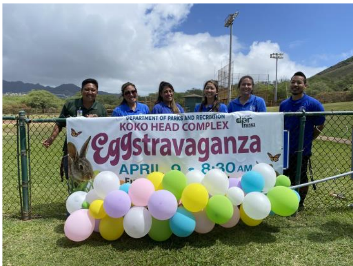
Honolulu Parks & Recreation staff.