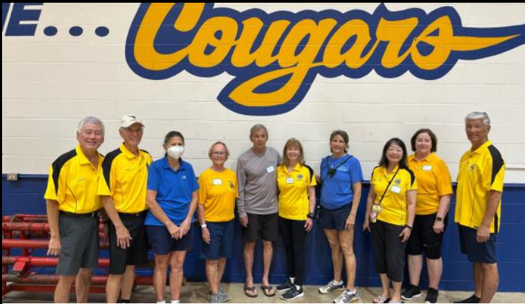
Hawaii Kai Lions at the Kaiser Complex 5th Grade Fitness Meet.