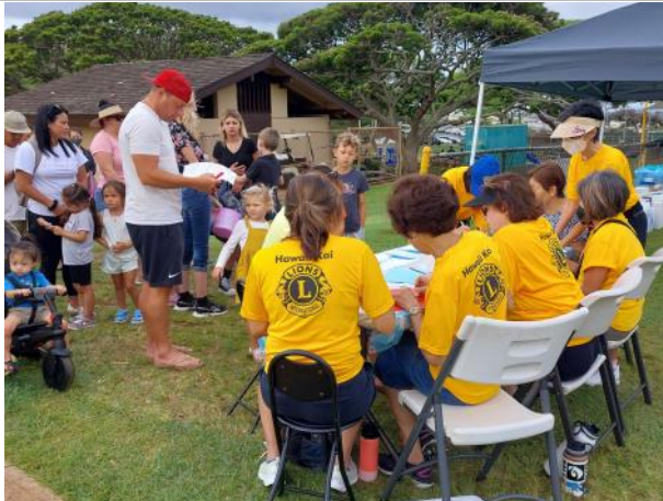
Hawaii Kai Lions checking-in participants.