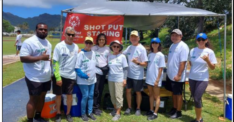
Hawaii Kai Lions in front of “Shot-Put” tent.