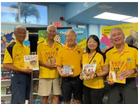
Hawaii Kai Lions at Hahaione Fun Fair — Library Book Sale